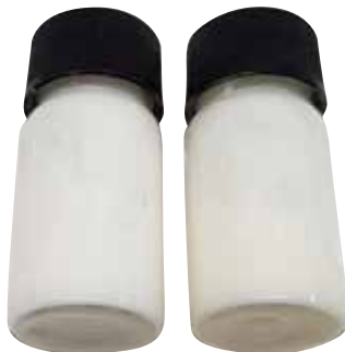
Picture: Organoleptic evaluation of formulations containing 4.25% CelluCap Resveratrol. (left) or 0.6% free resveratrol (right) following 4 months storage at 40°C.